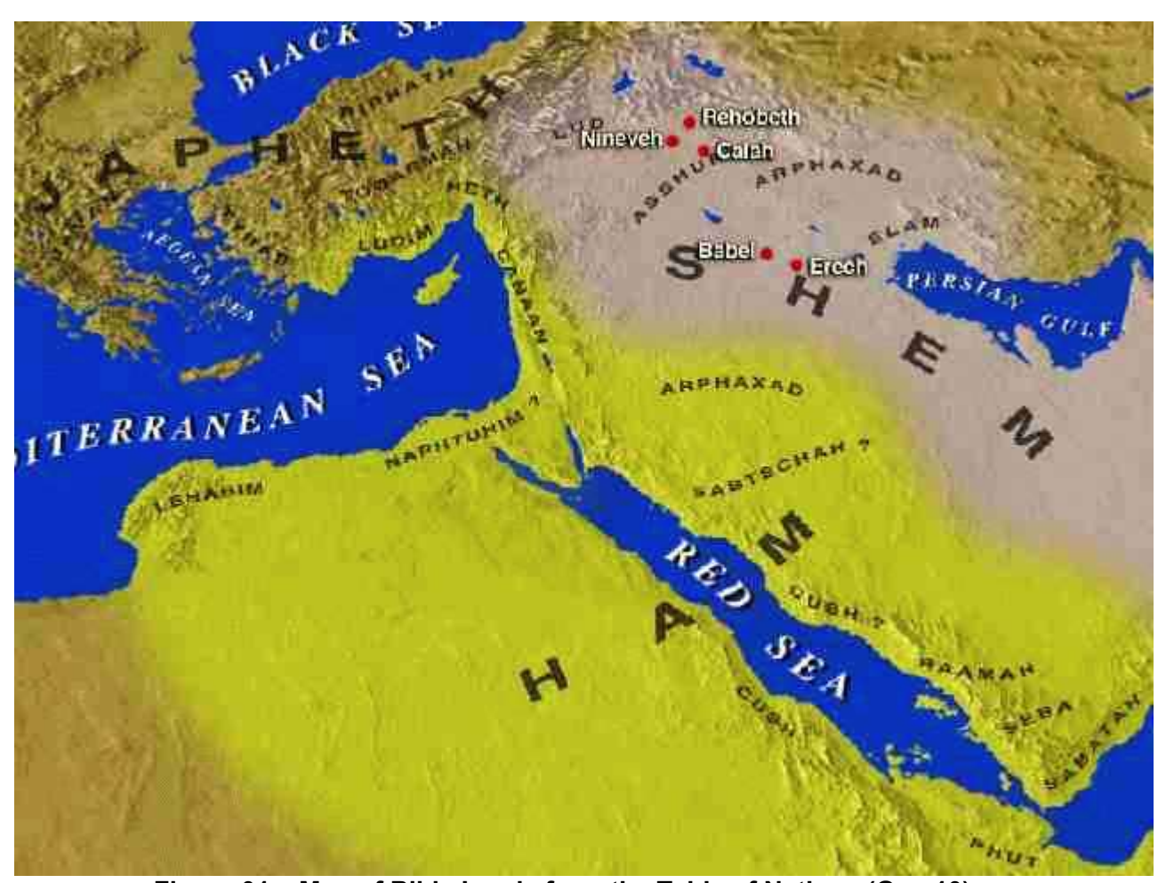
Figure 01. Map of Bible Lands from the Table of Nations (Gen 10).